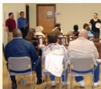
Community Outreach Page 3