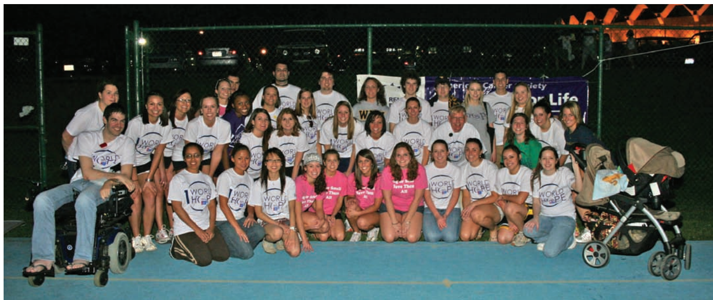
The SoP Relay for Life Team.