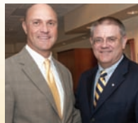
New Administration Page 8