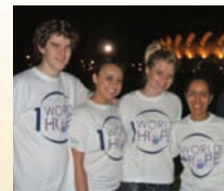
Relay for Life Page 15